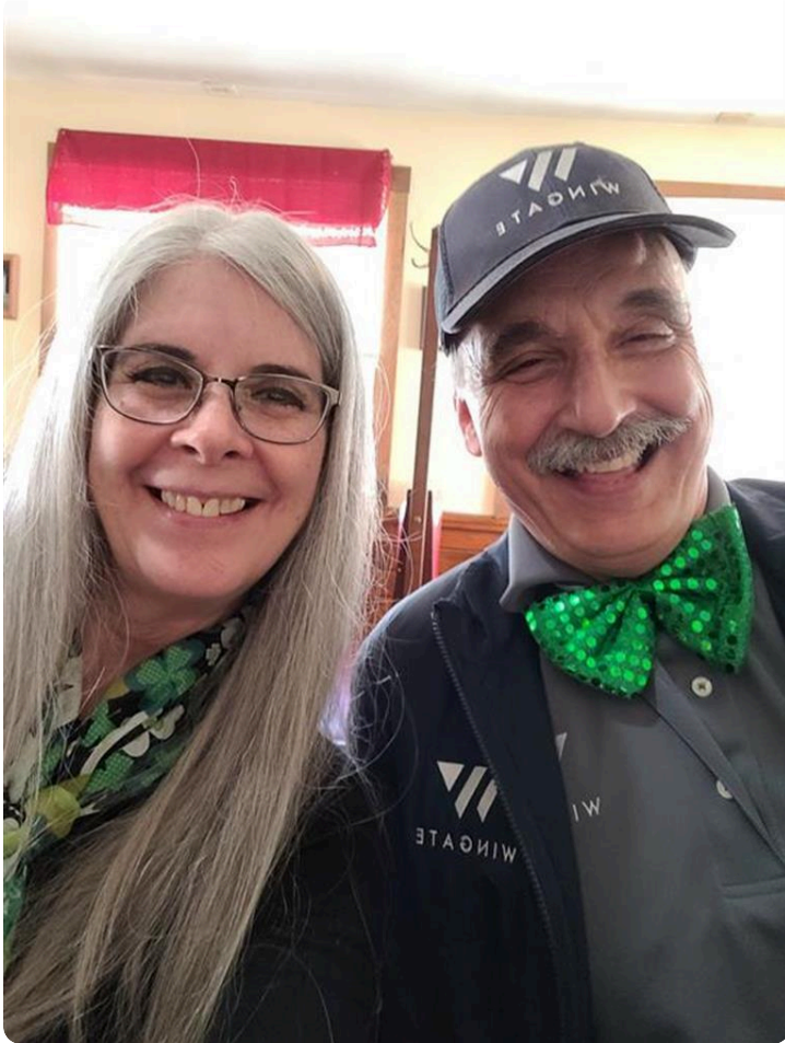
Rest in Peace my sweet sweet friend..I will miss you dearly!