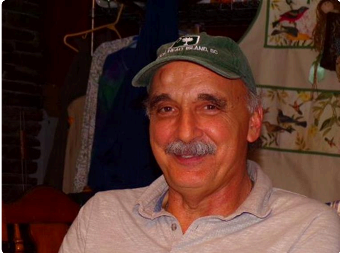
what a super hero he was